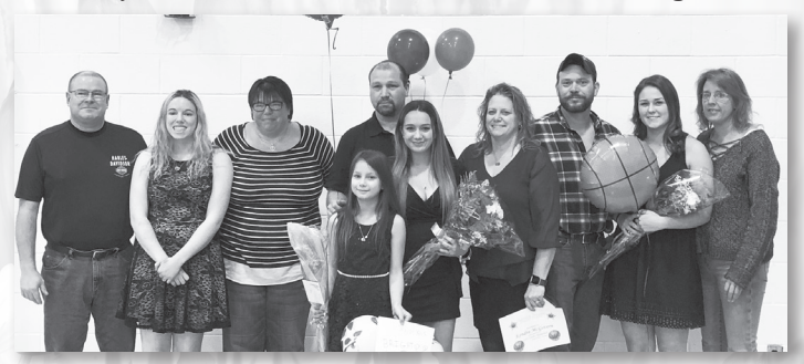
Girls' Basketball Senior Night