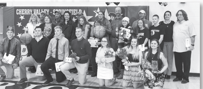
Boys' Basketball and Cheerleaders Senior Night