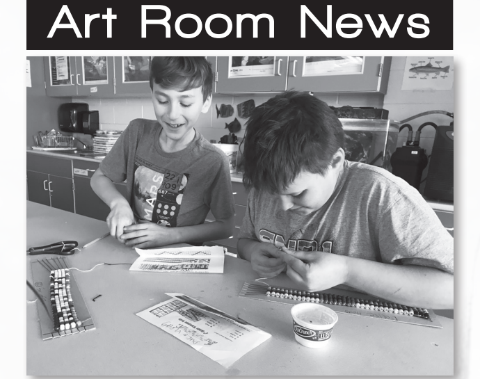
Fourth graders creating wampum belts on their lesson on local Native American traditions.